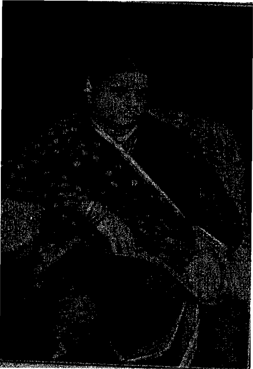
MRS. RAMABAI RANADE