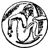
PROMETHEUS TORTURED BY AN EAGLE.

1 Cf. also the later satirical conception of "Misfortune as a wife" (the unlucky box of Pandora, in which Preller recognized the cysta mystica , the woman's genitals) links on to the old tradition in Hesiod,