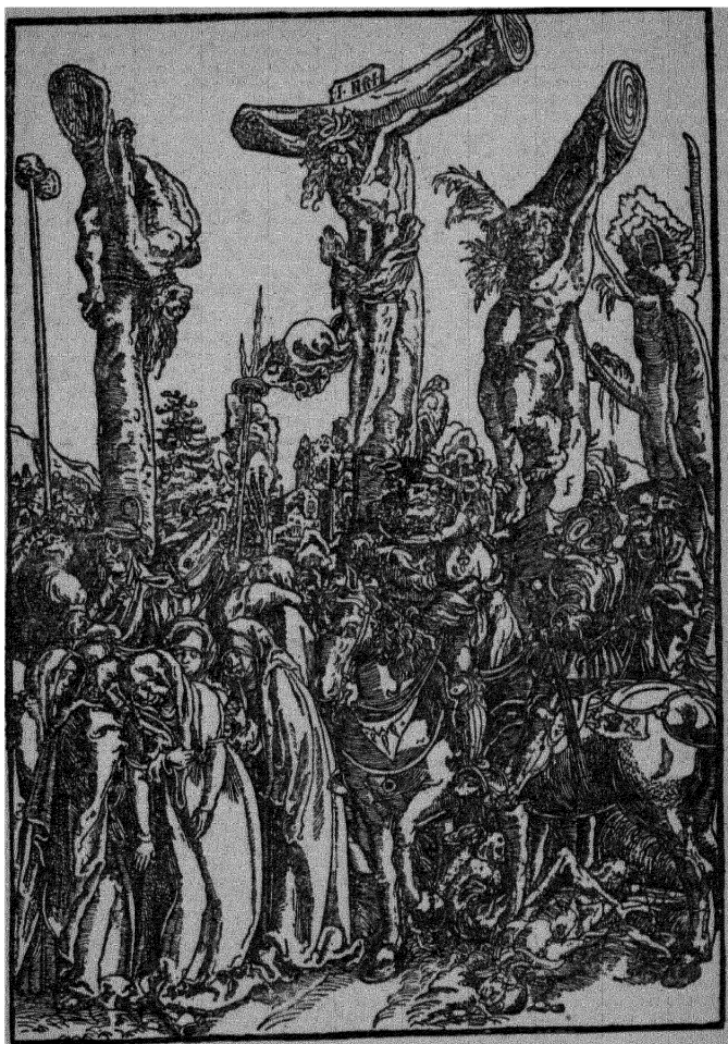
LUKAS CRANACH. CRUCIFIXION.