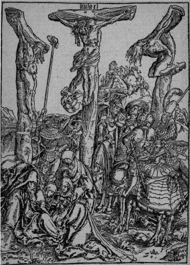
LUKAS CRANACH. CRUCIFIXION (1502).