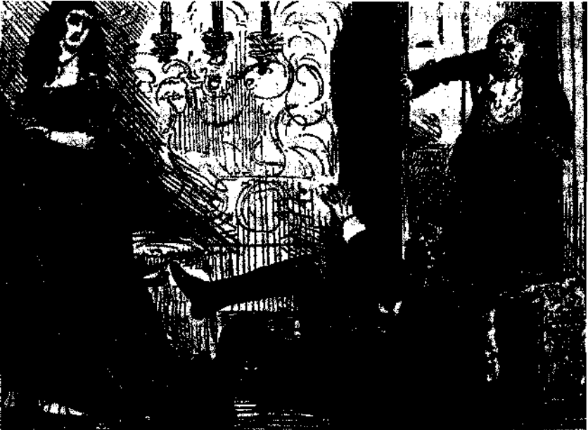
HE LOST HIS BALANCE, AND MEASURED HIS LENGTH UPON THE GROUND

"Not for the world," rejoined Sir Mulberry. Thus speaking, he leaned over, as if to replace her in her chair; but the young lady, making a violent effort to disengage herself, he lost his balance, and measured his length upon the ground.