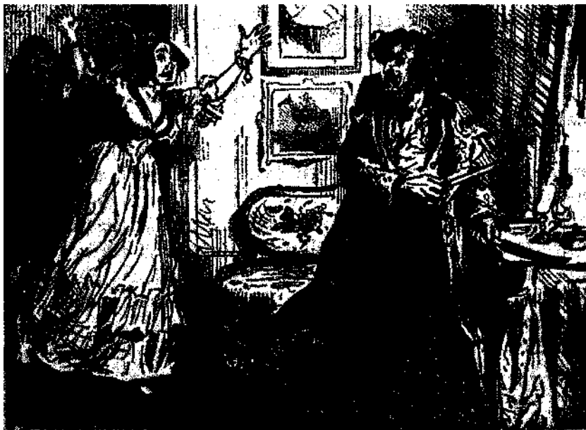
MR. MANTALINI WAS DISCLOSED TO VIEW, WITH HIS SHIRT COLLAR SYMMETRICALLY THROWN BACK

Mr. Mantalini, who had doubtless well considered his