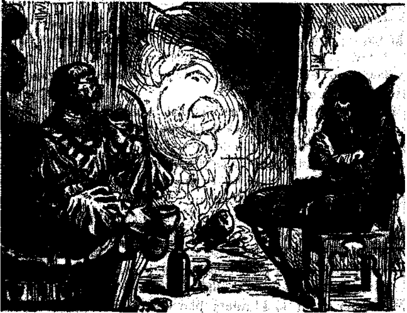
ON TBS OPPOSITE SIDE OF THE FIBS, THERE SAT WITH FOLDED ARMS A WRINKLED HIDEOUS FIGURE

"He thought about a great many things—about his present troubles and past days of bachelorship, and about the Lincoln greens, long since dispersed up and down the country, no one knew whither; with the exception of two who had been unfortunately beheaded, and four who had killed