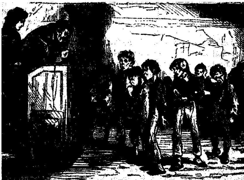
THE FIRST CLASS IN ENGLISH SPELLING AND PHILOSOPHY

"To be sure," said Squeers, by no means disconcerted.