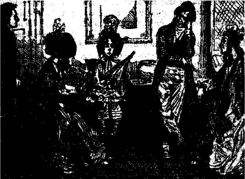
THE DRAMA IS GONE, PERFECTLY GONE," SAID MR. CURDLE

"Quite a new one," said Miss Snevellicci, "of which this