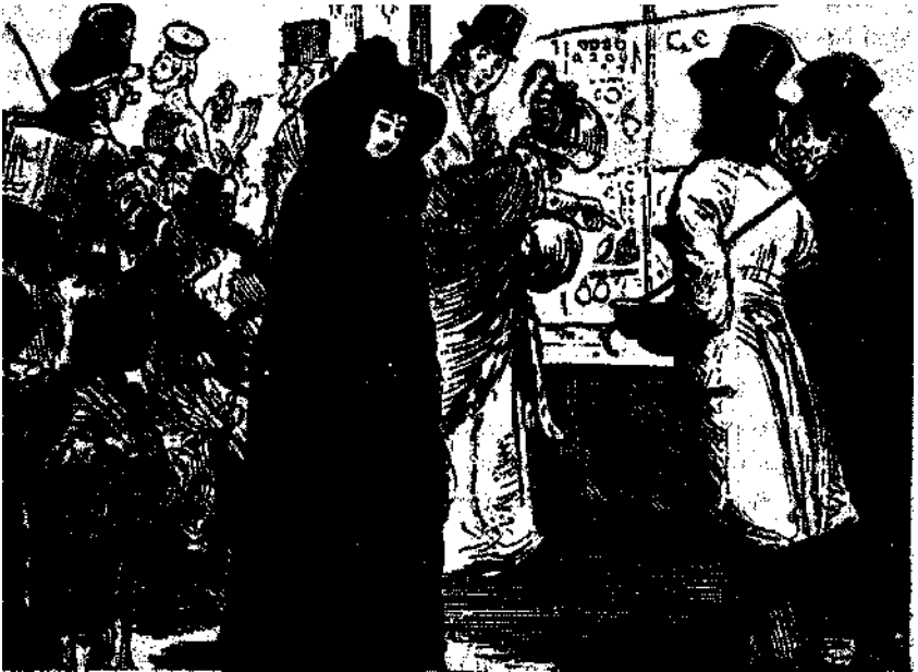
KATE WALKED SADLY BACK TO THEIR LODGINGS IN THE STRAND

she wished to be gone, but hesitated notwithstanding, as though unwilling to leave Mr. Mantalini the sole honor of showing them downstairs. Ralph relieved her from her perplexity by taking his departure without delay; Madame Mantalini making many gracious inquiries why he never came to see them; and Mr. Mantalini anathematizing the stairs with great volubility as he followed them down, in