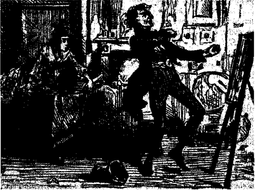
NEWMAN NOGGS JERKED HIMSELF ABOUT THE ROOM "WITH THE MOST ECCENTRIC MOTION

It was not a very awful weapon that Miss La Creevy held, it being in fact nothing more nor less than a black-lead pencil; but discovering her mistake, the little portrait painter exchanged it for a mother-of-pearl fruit knife, wherewith, in proof of her desperate thoughts, she made a lunge as she