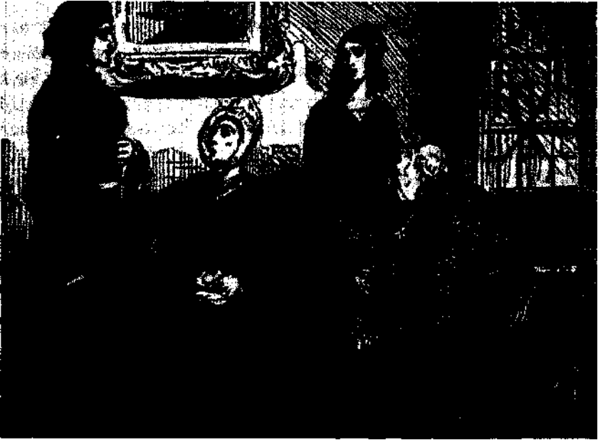
THE UNCLE AND NEPHEW LOOKED AT EACH OTHER FOR SOME SECONDS WITHOUT SPEAKING

looked at each other for some seconds without speaking. The face of the old man was stern, hard-featured and forbidding; that of the young one, open, handsome, and ingenuous. The old man's eye was keen with the twinklings of avarice and cunning; the young man's bright with the light of intelligence and spirit. His figure was somewhat slight, but manly and well-formed; and, apart from all the grace of youth and comeliness, there was an emanation from the warm young heart in his look and bearing which kept the old man down.