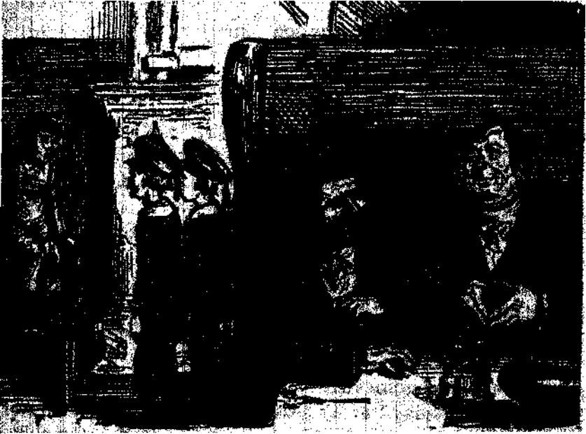
THE SCHOOLMASTER AND HIS COMPANION LOOKED STEADILY AT EACH OTHER FOR A FEW SECONDS

"Is he, indeed?" rejoined Mr. Snawley, looking at the