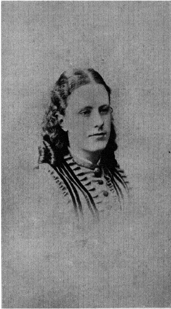
MISS MARTIN IN EARLY GIRLHOOD