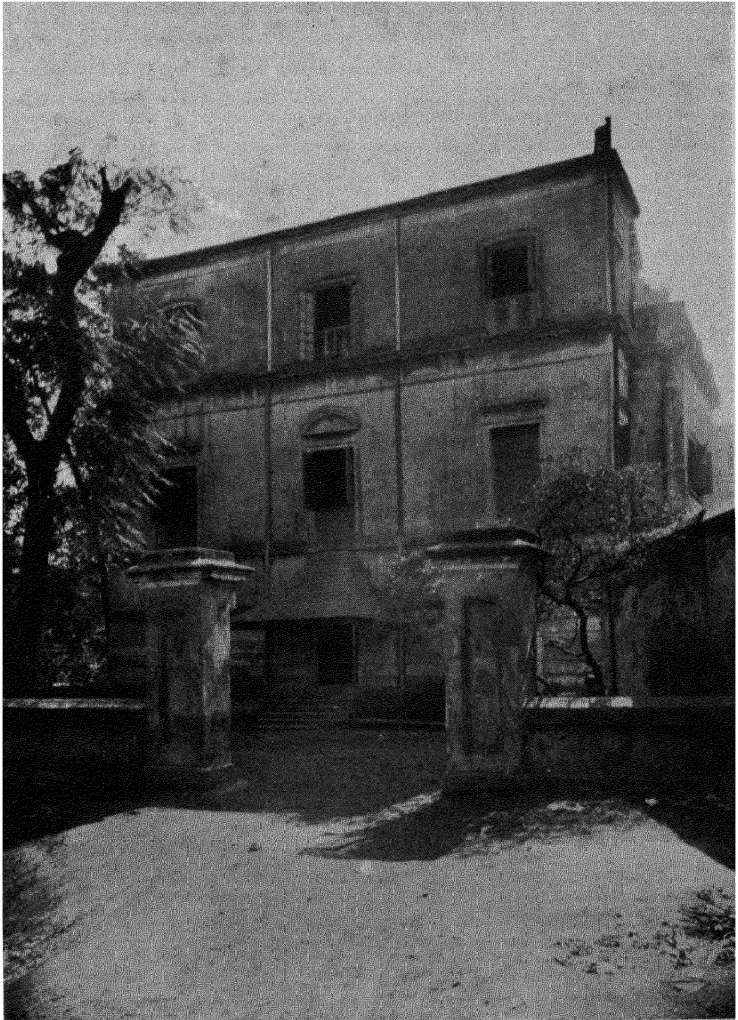
CITY HOUSE 12, Manicktollah Street