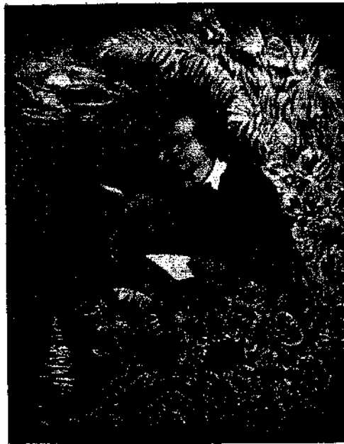
PORTRAIT OF LORD BYRON IN THE HEARTS OF THE BRITISH NATION