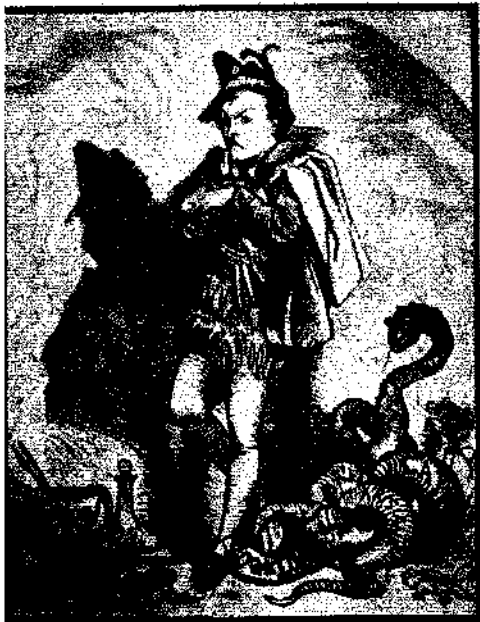
PORTRAIT OF LORD BYRON IN THE COLLECTION OF MRS BEECHER STOWE