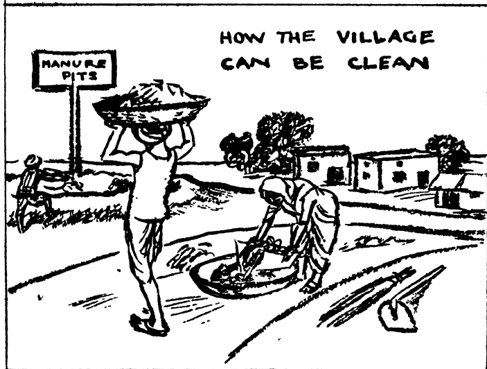
CLEANING THE VILLAGE