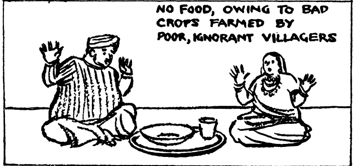
TOWN AND COUNTRY