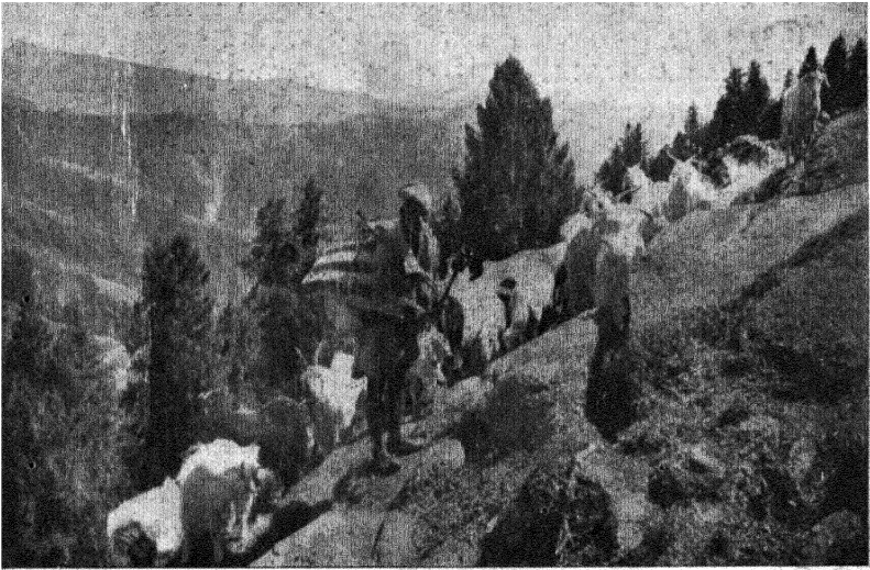
1. Kangra District Sheep and Goats.