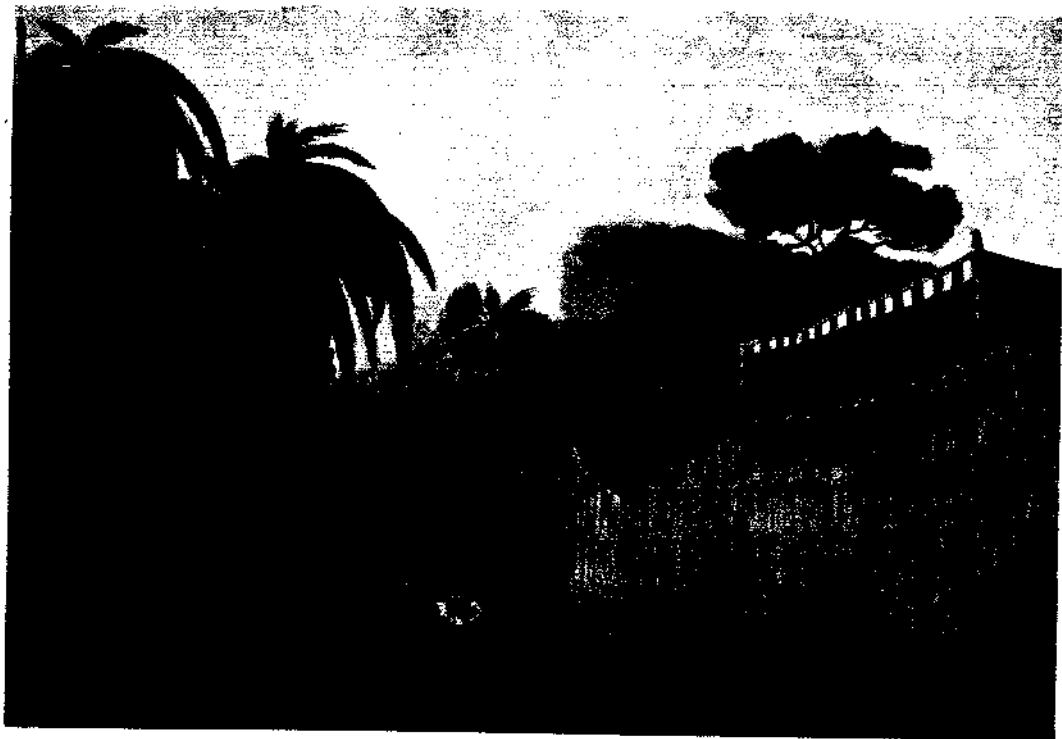
FIGHT BETWEEN A BUFFALO AND A TIGER