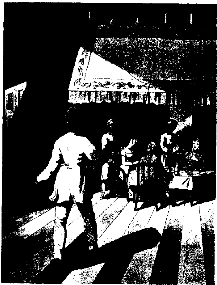
A FAMILY AT TABLE UNDER A PUNKAH