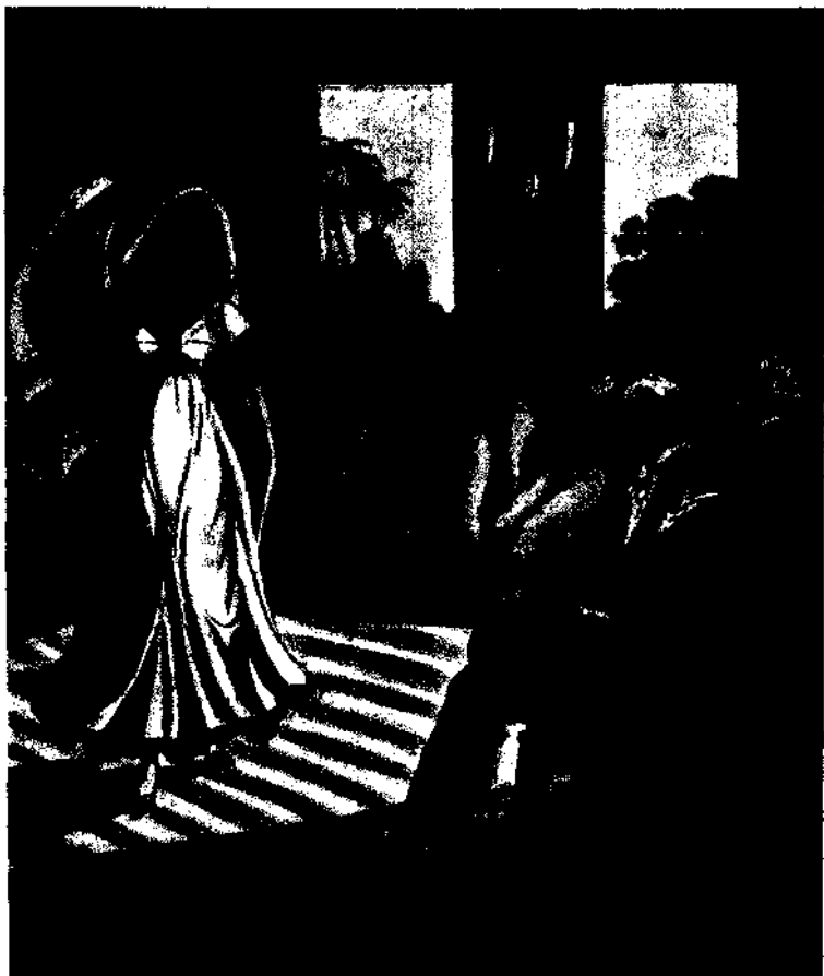
EUROPEANS WATCHING A NAUTCH GIRL DANCING