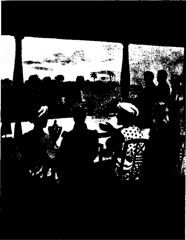
LORD WELLESLEY AT THE NAWAB OF OUDH'S BREAKFAST PARTY AND ELEPHANT FIGHT