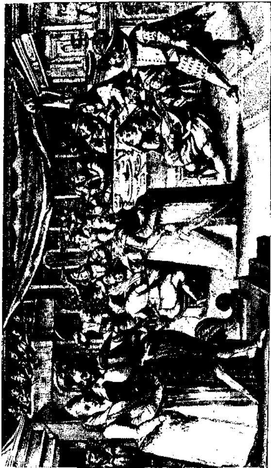
IN THE BANQUET HALL (From a print by Crispin de Passe in the Hortus Voluptatum Series)