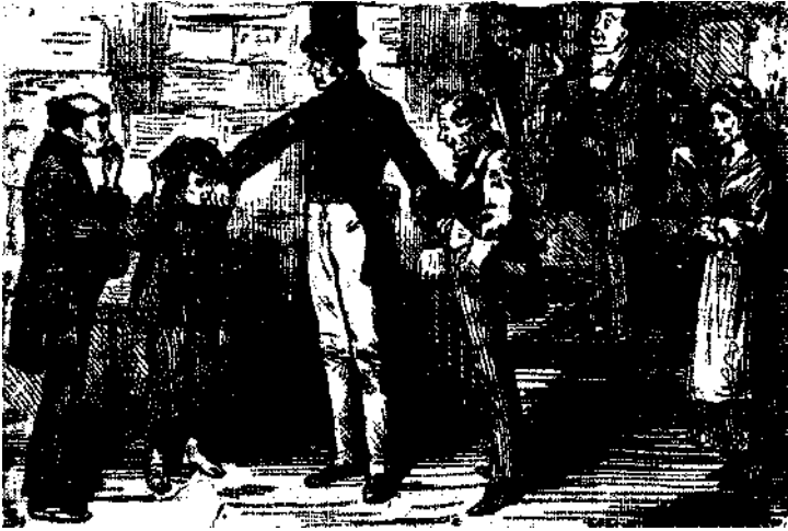
"WHO UD GO AND LET A NICK INNOCENT LODGING TO SUCH A REG'LAR ONE AS ME!"

"You don't expect anybody to believe this, about the lady