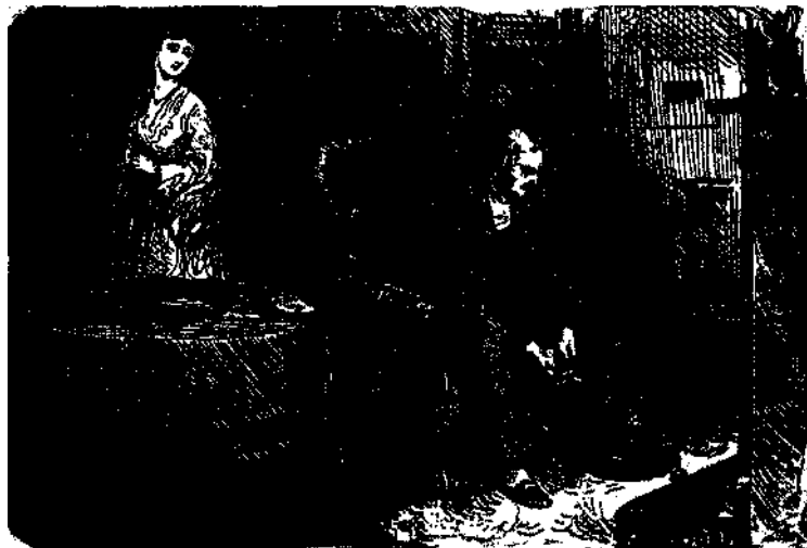
TO MY GREAT SURPRISE, ON GOING IN, I FOUND MY GUARDIAN STILL THERE, AND SITTING LOOKING AT THE ASHES

"I am working late to-night," said I, "because I couldn't sleep, and wished to tire myself. But, dear Guardian, you