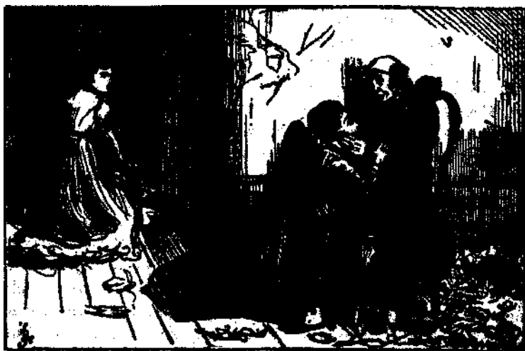
"NEVER HAVE A MISSION, MY DEAR CHILD"

Mr. Jellyby groaned, and laid his head against the wall