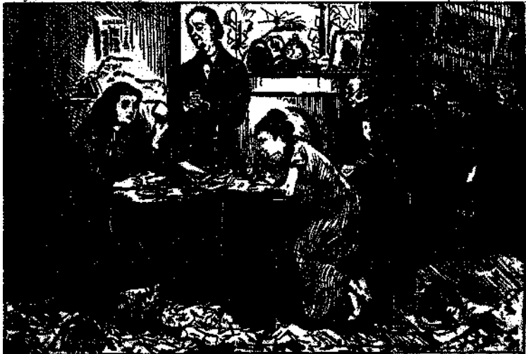
IN AN ATMOSPHERB OF BORRIOBOOLA-GHA

"You find me, my dears," said Mrs. Jelly by, snuffing the two great office candles in tin candlesticks which made the room taste strongly of hot tallow (the fire had gone out, and there was nothing in the grate but ashes, a bundle of wood, and a poker), "you find me, my dears, as usual, very busy; but that you will excuse. The African project at