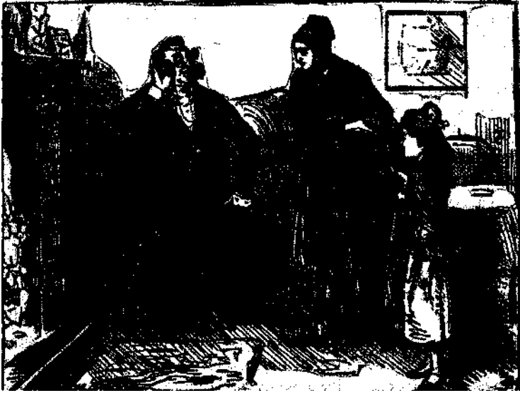
I AM INTRODUCED TO CONVERSATION KENG

The gentleman put up his eye-glasses to look at me, and said, "Come here, my dear!" He shook hands with me,