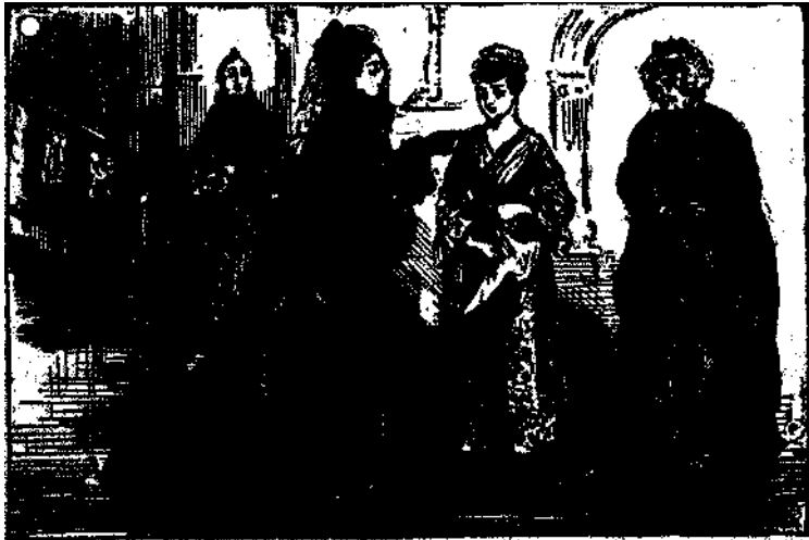
"WHY, DO YOU KNOW HOW PRETTY YOU ARK , CHILD?" SHE SAYS, TOUCHING HER SHOULDER WITH HER TWO FOREFINGERS

My lady taps her dimpled cheek with the same delicate gloved fingers, and goes on to the foot of the oak staircase, where Sir Leicester pauses for her as her knightly escort. A staring old Dedlock in a panel, as large as life and as dull,