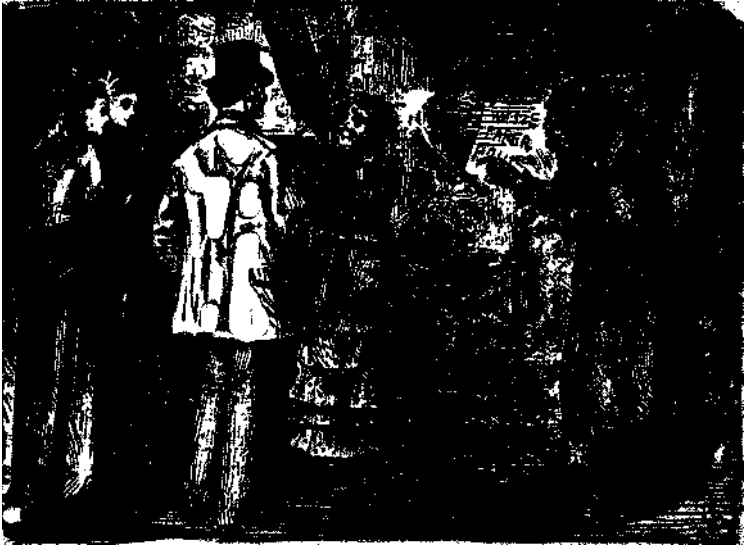
THE LORD CHANCELLOR RELATES THE DEATH OF TOM JARNDYCE

"He come in at the door," said the old man, slowly pointing an imaginary track along the shop, "on the day he did it—the whole neighborhood had said for months before that he would do it, of a certainty, sooner or later—he come in at the door that day, and walked along there, and sat himself on a bench that stood there, and asked me (you'll judge I was a mortal sight younger then) to fetch him a pint of wine. 'For,' says he, 'Krook, I am much depressed; my cause is