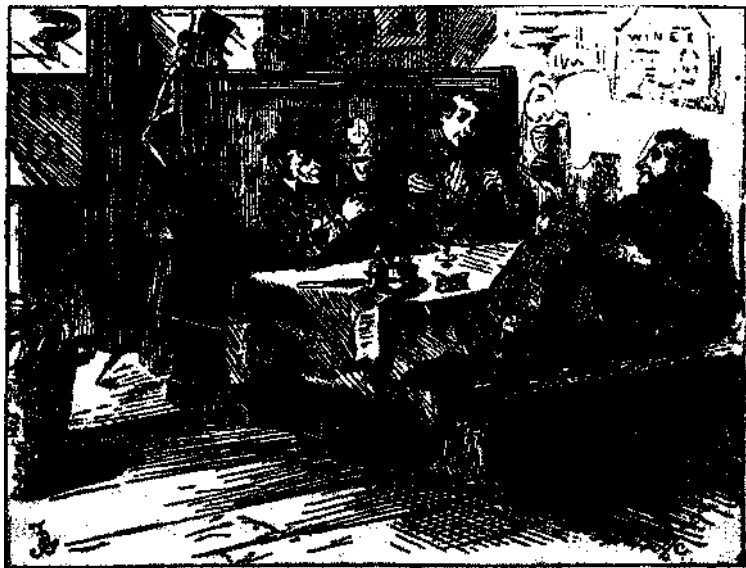
"I AM GROWN UP, NOW, GUPPY. I HAVE ARRIVED AT MATURITY"

"Thank you, Guppy," says Mr. Jobling. "I really don't know but what I will take summer cabbage."