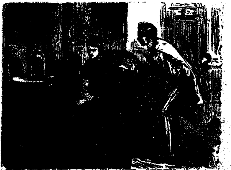
MR. GUPPY'S CATECHISM

merson's image imprinted on my 'art—which I mention in confidence—I found, when I had the honor of going over your ladyship's mansion of Chesney Wold, while on a short out in the county of Lincolnshire with a friend, such a resemblance between Miss Esther Summerson and your ladyship's own portrait, that it completely knocked me over; so much so, that I didn't at the moment even know what it was that knocked me over. And now I have the honor of beholding your ladyship near (I have often, since that, taken