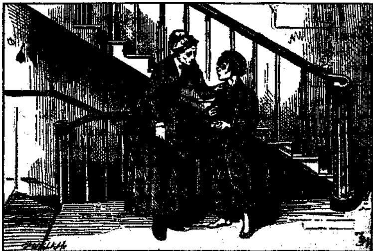
"WHAT'S GONE OF YOUR FATHER AND YOUR MOTHER, EH?"

But downstairs is the charitable Guster, holding by the handrail of the kitchen stairs, and warding off a fit, as yet