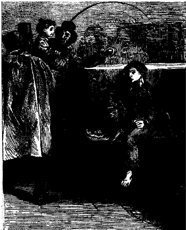
FRONTISPIECE—Bleak House, Vol. Twenty-two.