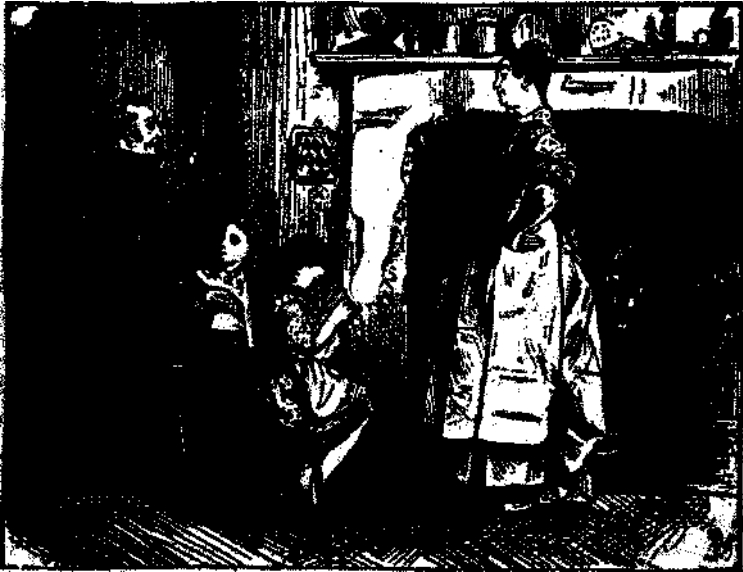
I BELIEVE YOU!" SAYS MRS. BAGNET. "HE'S A BRITON. THAT'S WHAT WOOLWICH IS. A BRITON!"

Mr. George is becoming thoughtful; sitting before the fire in the whitewashed room, which has a sanded floor, and a barrack smell, and contains nothing superfluous, and has not a visible speck of dirt or dust in it, from the faces of Quebec and Malta to the bright tin pots and pannikins upon the dresser shelves—Mr. George is becoming thoughtful, sitting here while Mrs. Bagnet is busy, when Mr. Bagnet and young Woolwich opportunely come home. Mr. Bagnet is an ex-artillery man, tall and upright, with shaggy eye-