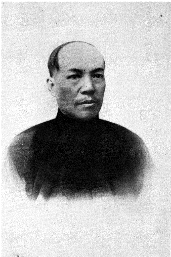
THE LATE LIANG CHI-CHAO 1873-1929