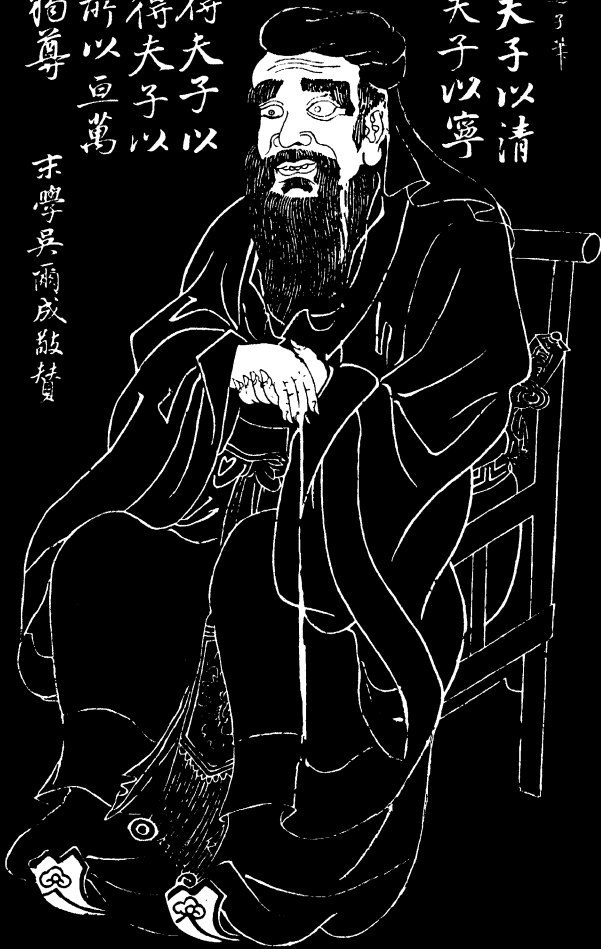
A PORTRAIT OF CONFUCIUS OF THE TANG DYNASTY