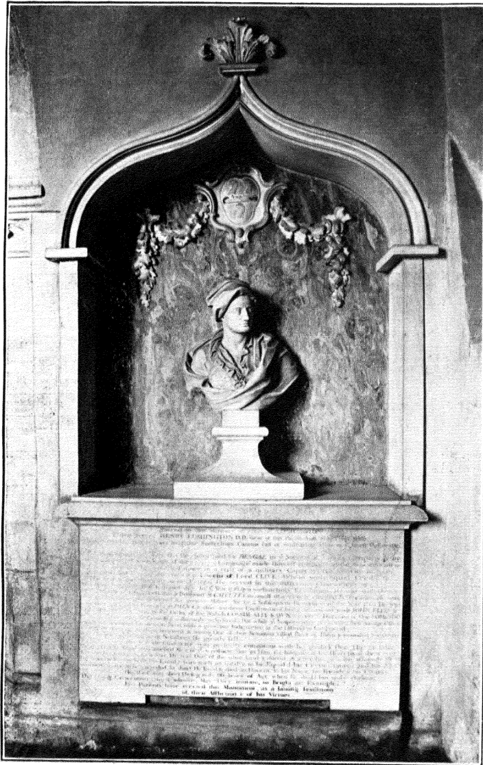
THE LUSHINGTON MONUMENT.