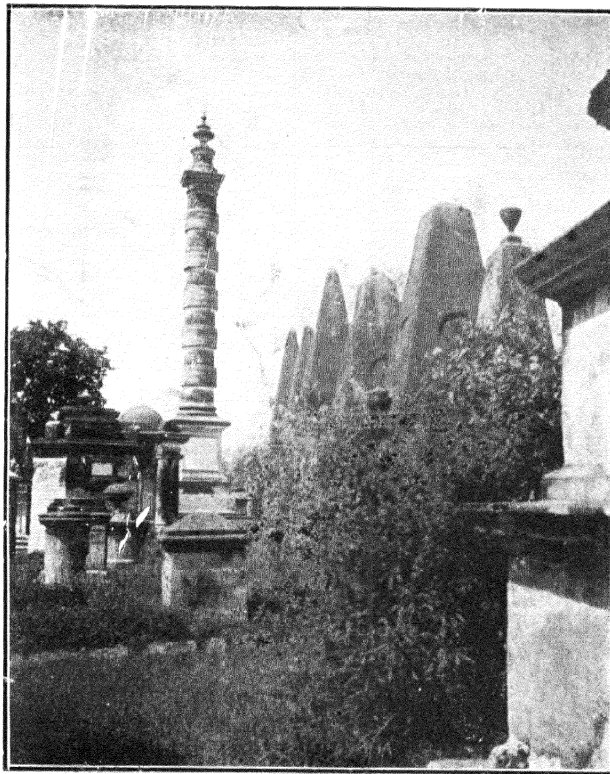
The Memorial Obelisk in Patna Cemetery.