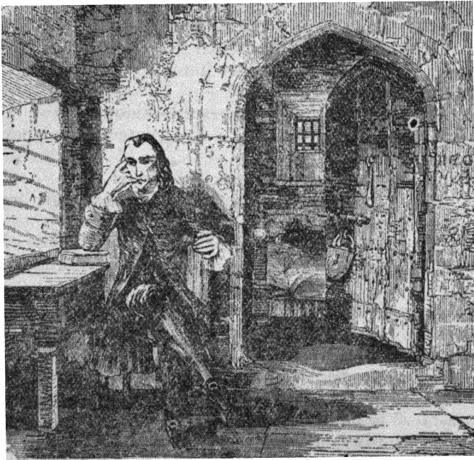
LORD GEORGE GORDON IN THE TOWER

Not another word was spoken on either side. They crossed swords and attacked each other fiercely. They were well matched. Each was skilled in the management of his