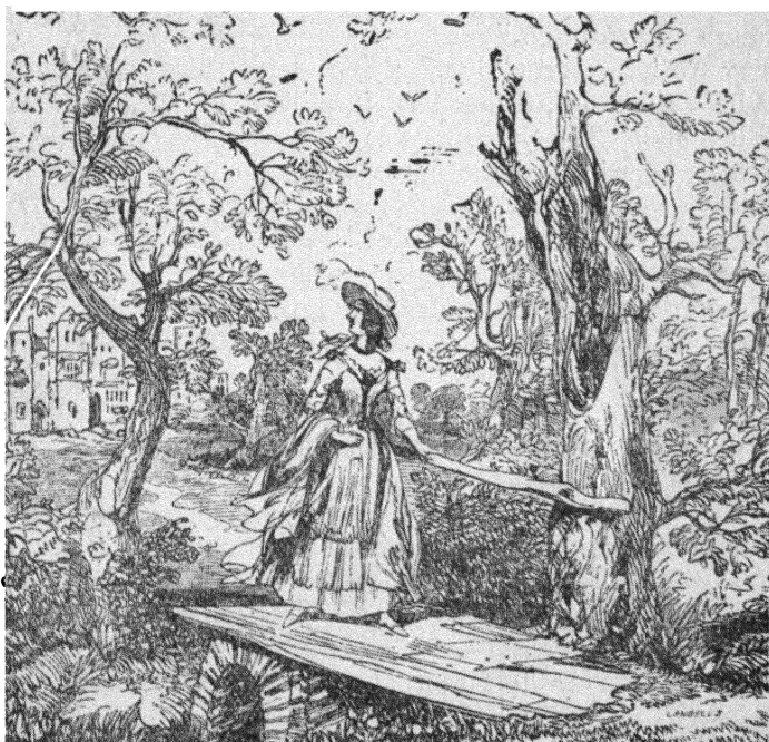
MISS HARLDALE ON THE BRIDGE

He walked away at a great pace, full of great thoughts of going for a soldier and dying in some foreign country, where it was very hot and sandy and leaving unheard of wealth to Dolly. He pushed on vigorously until the noise of London sounded in his ears, and an inn called the Black