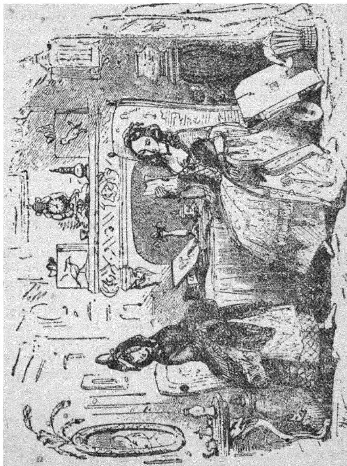
READING THE LOVE-LETTER