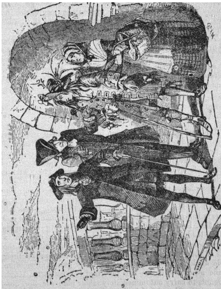
BARNABY IS ENROLLED