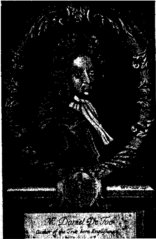
PORTRAIT OF DEFOE.

Engraved by Vandergucht, after a painting by Taverner (?) prefixed to the first volume of the collected writings (1703).