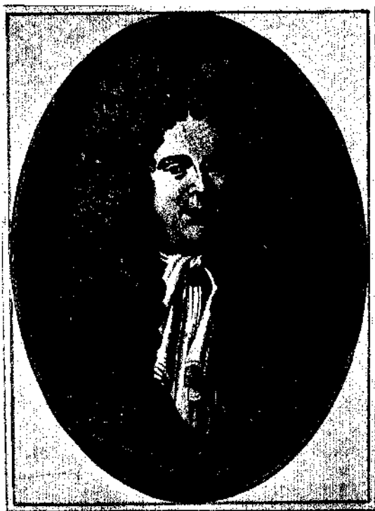
ENGRAVED PORTRAIT OF DEFOE.