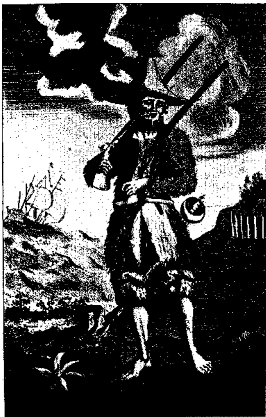
PORTRAIT OF ROIJINSON CRUSOE.

From the first edition (1719) in the British Museum.