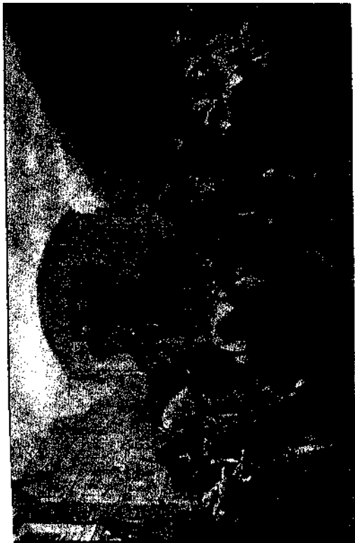
DEFOE IN THE PILLORY.