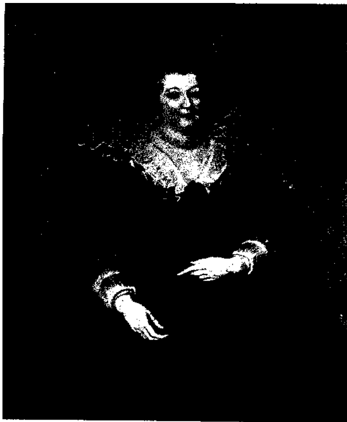
MARIE DE MEDICIS From the portrait by Rubens