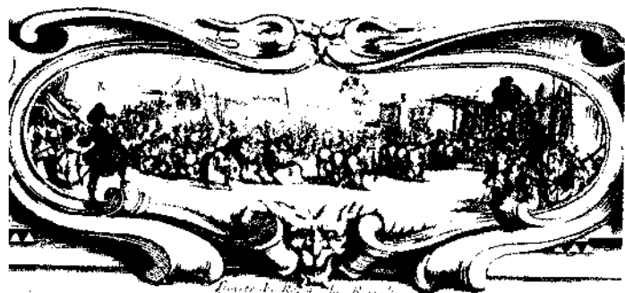
Bataille de Rochelle, le 10 Août.