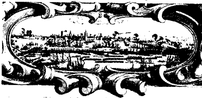
LA SIÈGE DE LA ROCHELLE Sections from the Border of the engraving by Jacques Callot