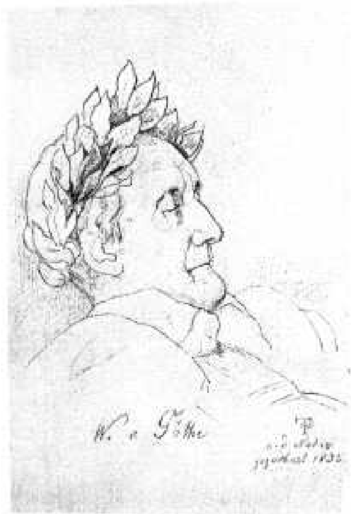
FROM A DRAWING OF GOETHE ON HIS DEATH-BED. BY F. PRELLER