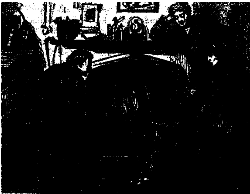
"SPEAK OUT!" SAID MARTIN, "AND SPEAK THE TRUTH"

Martin was about to interrupt him again, but John West-