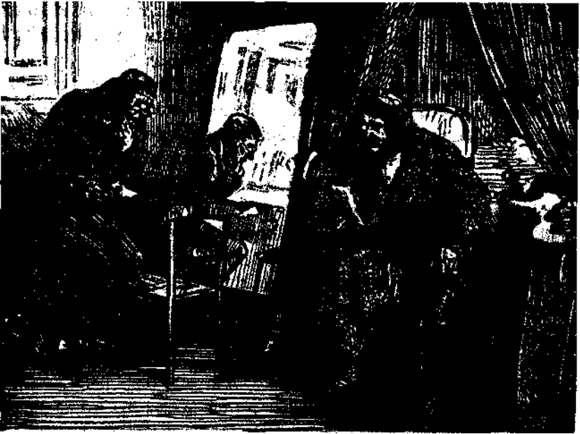
HE. NADGHTT PRODUCRS THE RESULT OF HIS PRIVATE INQUIRIES

in front of it; leaving room for his own legs between them. He then sat down in chair number two, and laid his pocket-book, very carefully, on chair number one. He then untied the pocketbook, and hung the string over the back of chair number one. He then drew both the chairs a little nearer Mr. Montague, and opening the pocketbook spread out its contents. Finally, he selected a certain memorandum from the rest, and held it out to his employer, who, during the