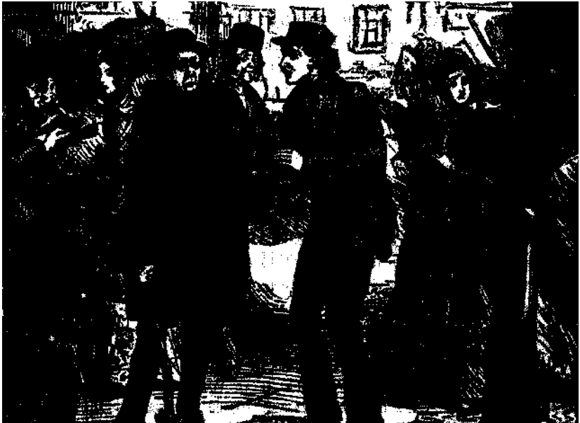
MR. MODDLE, WITH A DARK LOOK, REPLIED: "THE DRIVERS WON'T DO IT

"That there are some men," interrupted Moddle, with