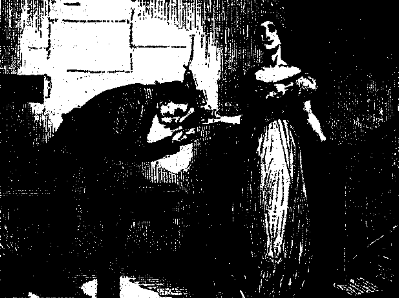
ON THE FOURTEENTH NIGHT, HE KISSED HISS PECKSNIFF'S SNUFFERS, IN THE PASSAGE

In short, Mr. Moddle began to be impressed with the idea that Miss Pecksniff's mission was to comfort him; and Miss Pecksniff began to speculate on the probability of its being