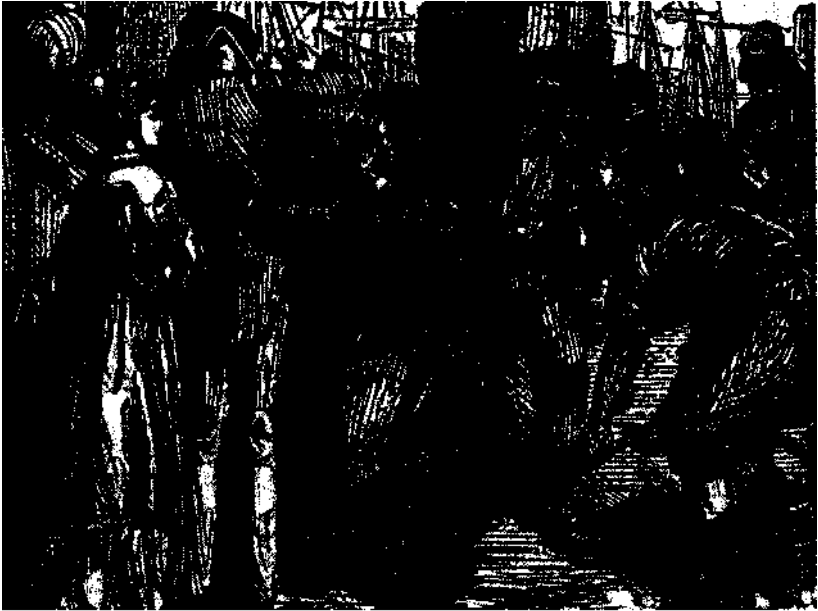
MRS GAMP CREATES A SENSATION WITH HER UMBRELLA

The lady cried out fiercely, "Where's the pelisse!"—meaning the constabulary—and went on to say, shaking the handle of the umbrella at Tom, that but for them fellers never being