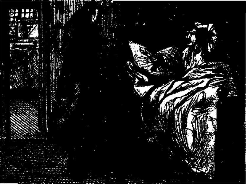
AWOKE TO FIND JONAS STANDING AT HIS BEDSIDE WATCHING HIM. AND THAT VERY DOOR WIDE OPEN

although he was heavily responsible for it, and a party to it, he was harassed even in his vision by a distracting uncertainty in reference to its import. Incoherently entwined with this dream was another, which represented it as the hiding-place of an enemy, a shadow, a phantom; and made it the business of his life to keep the terrible creature closed up, and prevent it from forcing its way in upon him. "With this view Nadgett and he, and a strange man with a bloody