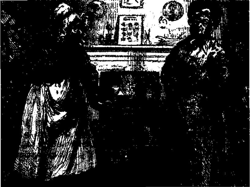
THEN MRS. GAMP ROSE—MORALLY AND PHYSICALLY ROSE—AND DENOUNCED HER

The shock of this blow was so violent and sudden that Mrs. Gamp sat staring at nothing with uplifted eyes, and her mouth open as if she were gasping for breath, until Bet-