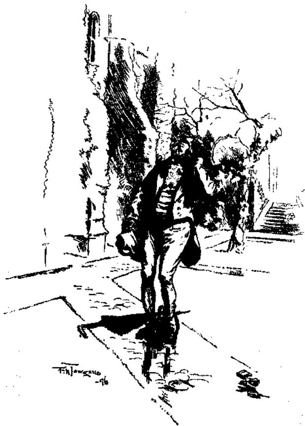
Alighted on the doctor's head as he was crossing the court