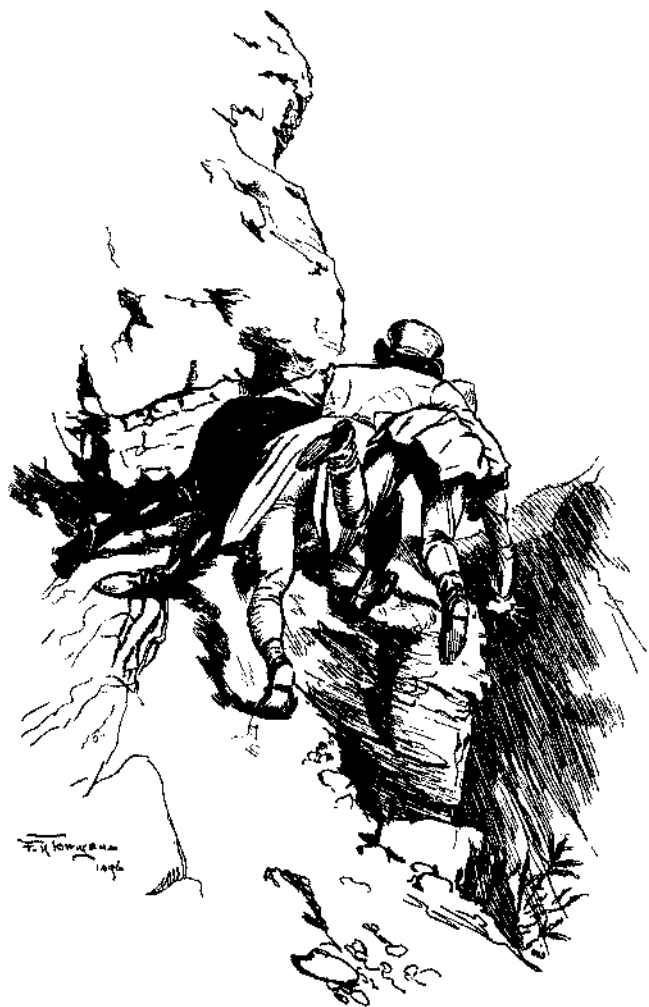
He caught them both up, one under each arm.