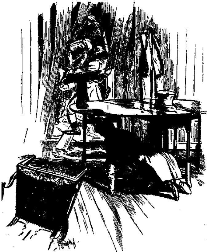
Sir Bonus Mac Scrip reheated through the breach, and concealed himself under the dining-table.