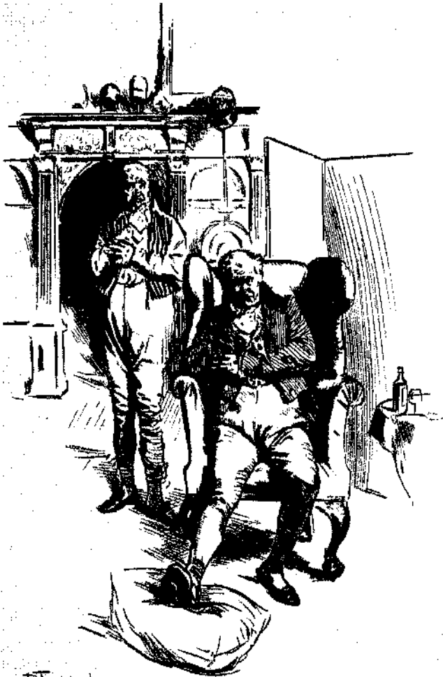
Old Harry had become, by long habit, a curious species of animated mirror.