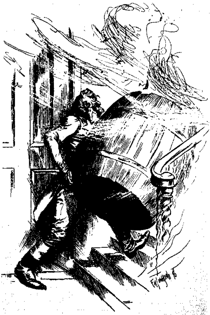
Sir Ora« Haut-ton ascending the stairs with the great rain-water tub.