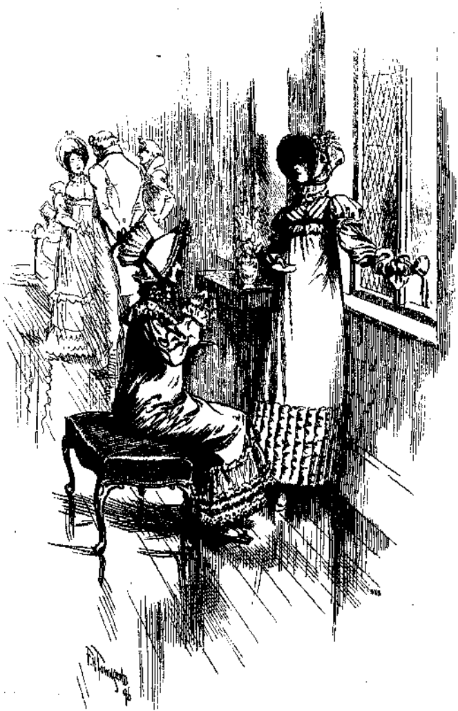
The company was sipping, not without many ivryfaces their anti-saccharine tea.