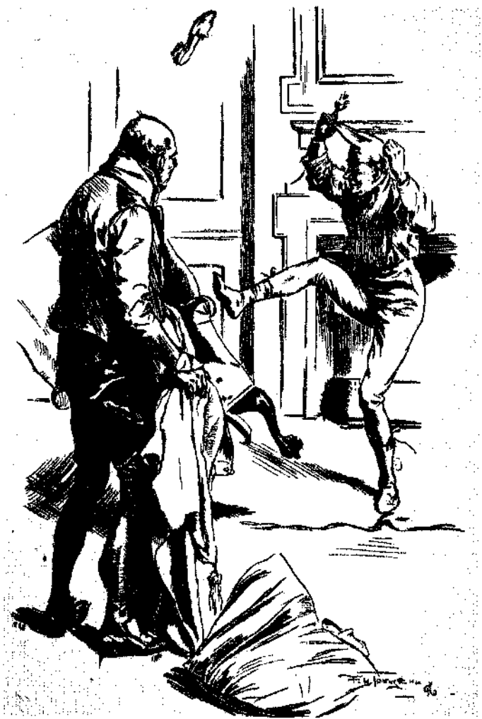
Sprang up, flung his night-gown one way, his night-cap another.