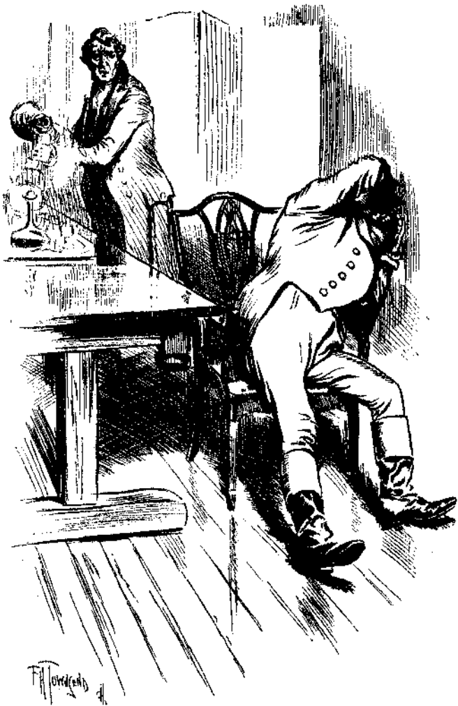
Sir Oran, throwing himself into a chair, began to shed tears in great abundance.