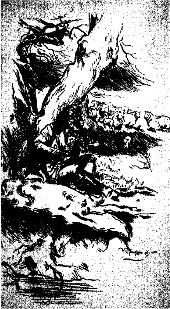
Sir Or an Haut-ton.