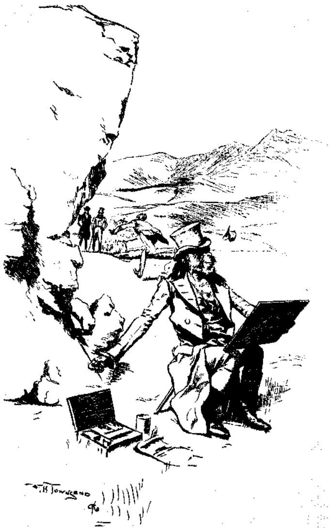
Sir Oran sat down in the artists seat.