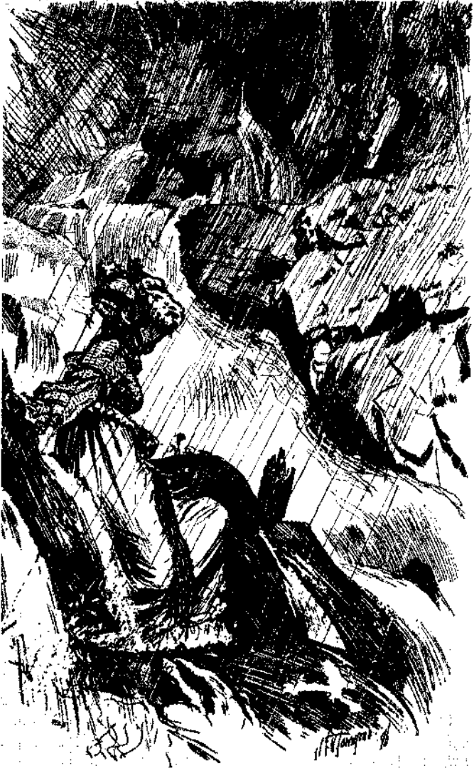
Proceeded very deliberately to pull up a pine.