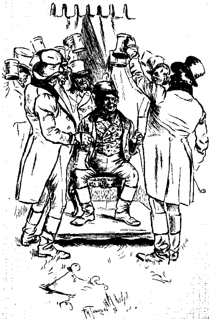
'stail, filwal unit ,'