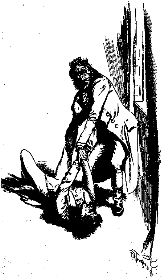
Preparing to administer natural justice by throwing him out at the window.