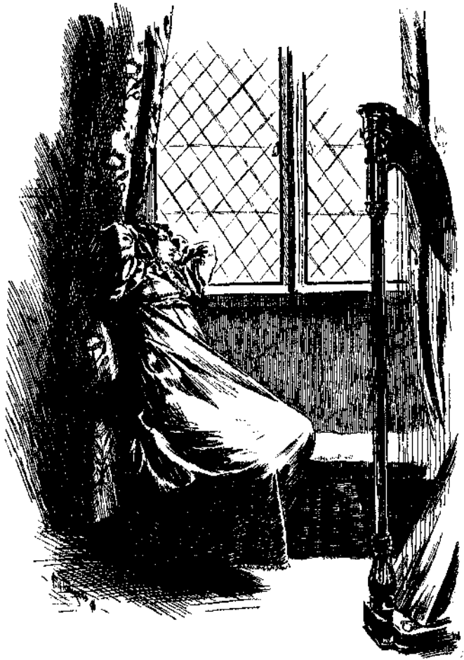
Gazing on the changeful aspects of the wintry sea.