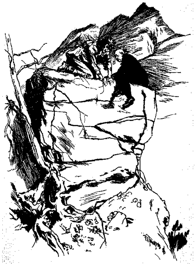
Perched on the summit of the rock'