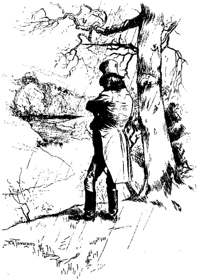
Mr. Fax was of opinion that he was smitten.