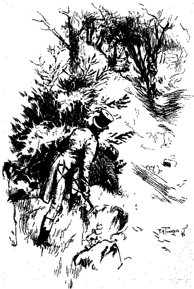
She immediately ran through the shrubbery.