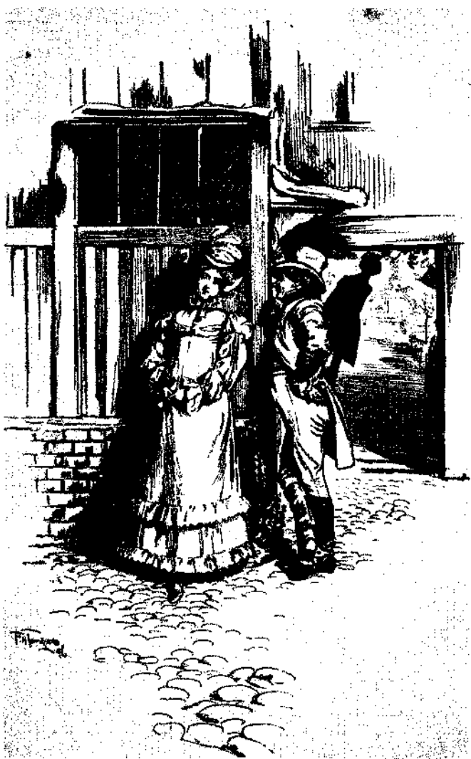
Both Irishmen and clergymen.