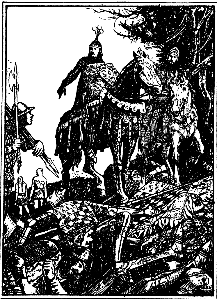
The Black Prince finds the body of Robert de Duras on the field of battle.

Wales's thanks to the Cardinal of Périgord for his courteous