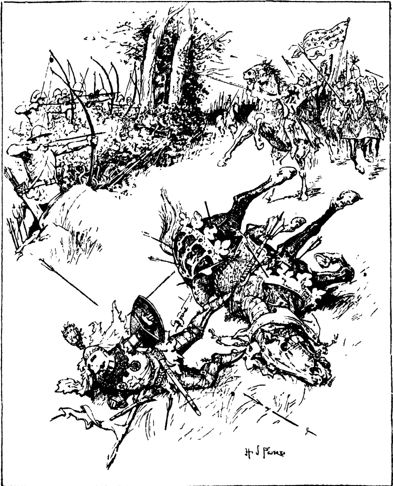
The English archers and French men-at-arms.

not bolt went back and joined the King's own division; they must have been good men to come again after such a