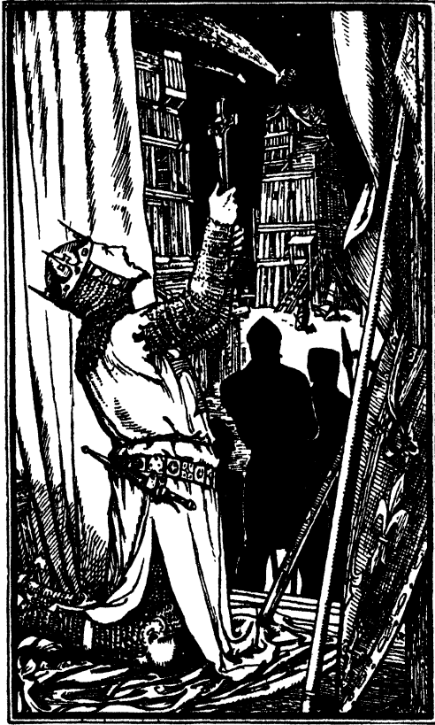
St Louis prays to avert the Greek fire from his Towers.

This Greek fire was in fashion like to a large barrel, and its trail of fire was as long as a great spear; it made a