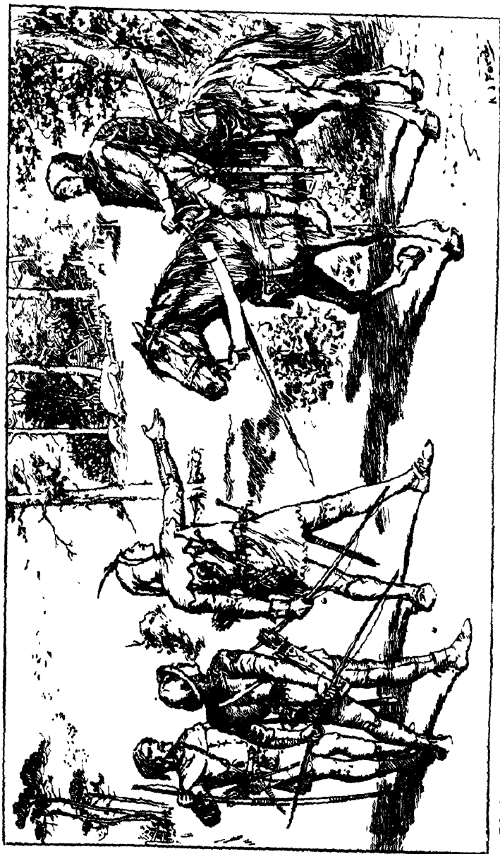
Little John with Much and Scathelock invite the gentle and sad knight to dine with Robin Hood.