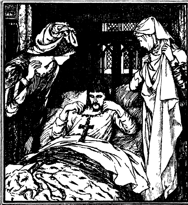
St Louis puts on the Cross.

I shall now relate. It happened that the good King was taken grievously ill at Paris, and so evil was his state that I have heard how one of the ladies who nursed him, thinking that all was over, would have covered his face with a sheet, but that another lady who was on the opposite side of the bed (so God willed it) would not suffer his face to