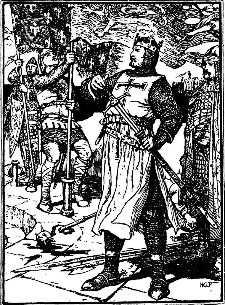
The Banners of England and France together are raised on the Towers of Messina.

and banners of King Richard floating above the walls of