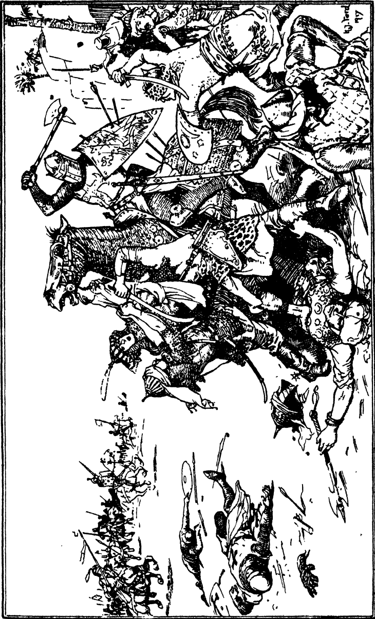
King Louis fought with such valour that he alone delivered himself.