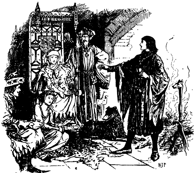
Harry Marland describes the battle of Poitiers to his family.

'Well,' said Harry cheerfully, 'where am I to begin? You know we started on the ninth of August and drew covert after covert for more than a month before we found