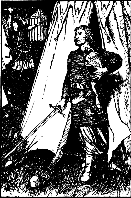
King Richard aroused by the Night Alarm.

The troops were skilfully drawn up in lines and columns, with officers to keep them in order. The knights' were posted nearer the shore, with their left near the Church of St Nicholas, for the Turks had launched their heaviest