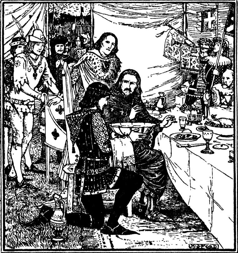
Edward the Black Prince waits on his prisoner the King of France.

and the Sire de Bourbon rose from his seat on the King's left to give up his place to the Prince. But the Prince remained kneeling, and there was a sudden hush all through the tent so that we could hear every word that followed.