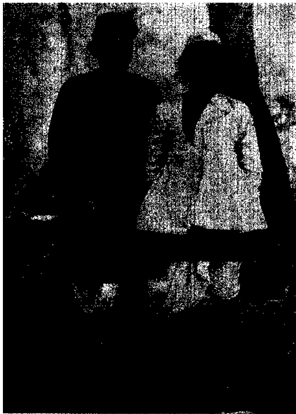
Mahābrāhmans (Mirzapur district)