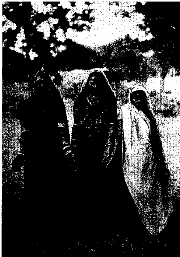
Banjara women (Mirzapur district)