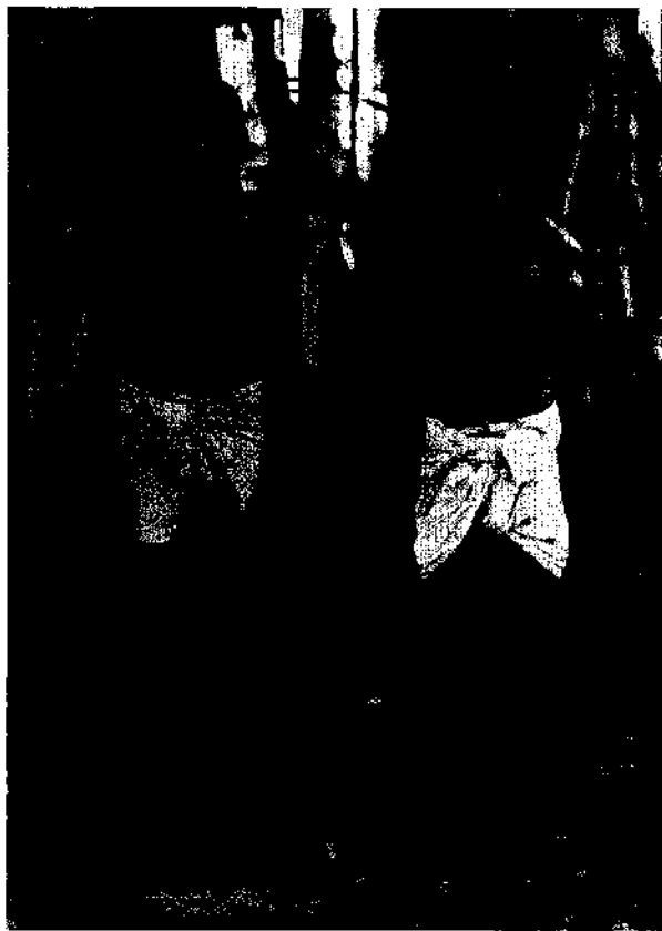
Seoris or Savaras (Mirzapur district)