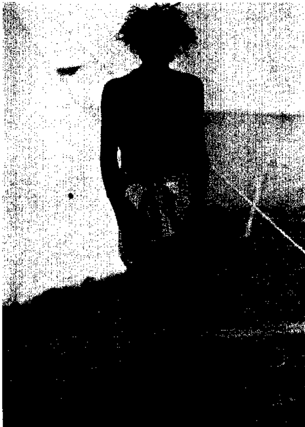
A Bhuiyār (Mirzapur district)