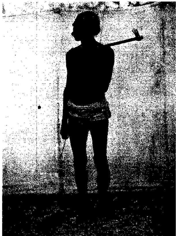
A Ghāsiya (Mirzapur district)