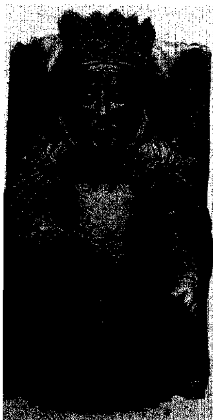
Henry the Fourth from his monument in Canterbury Cathedral