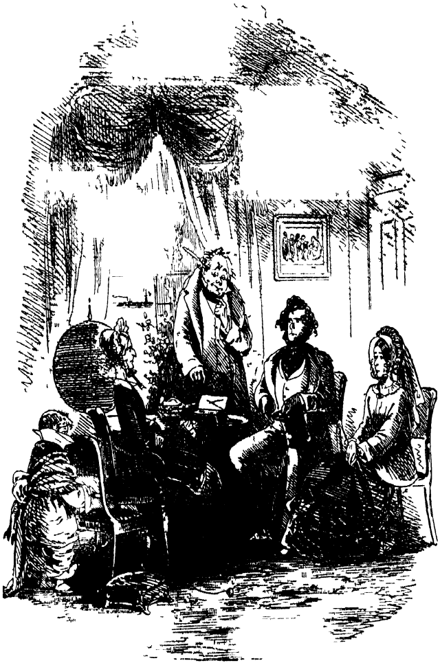
THE MOMENTOUS INTERVIEW