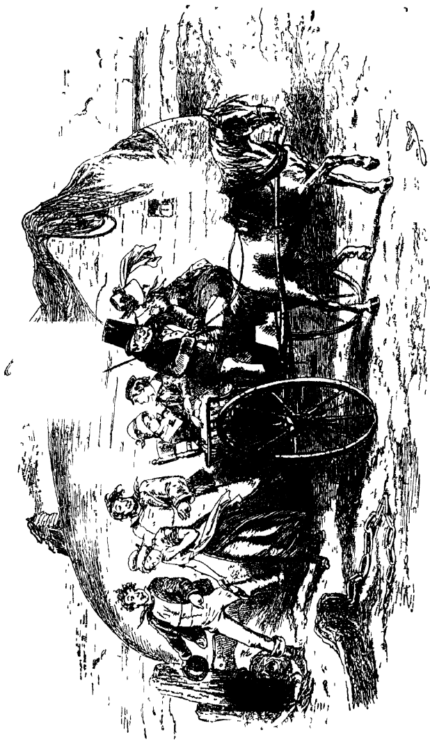
MRS GUMMIDGE CASTS A DAMP ON OUR DEPARTURE