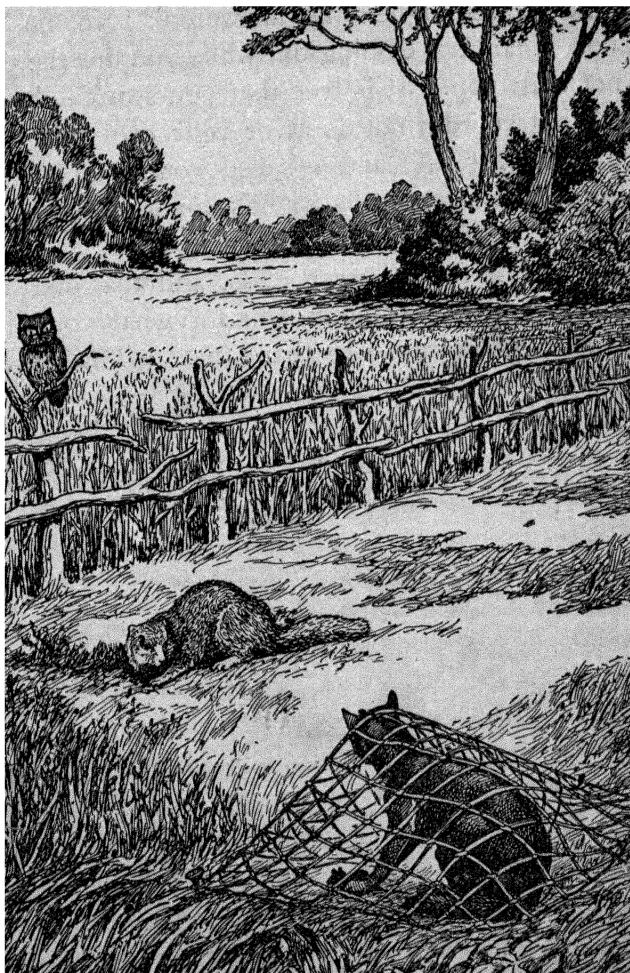
THE CAT HELD THE MOUSE SAFE IN HER PAWS