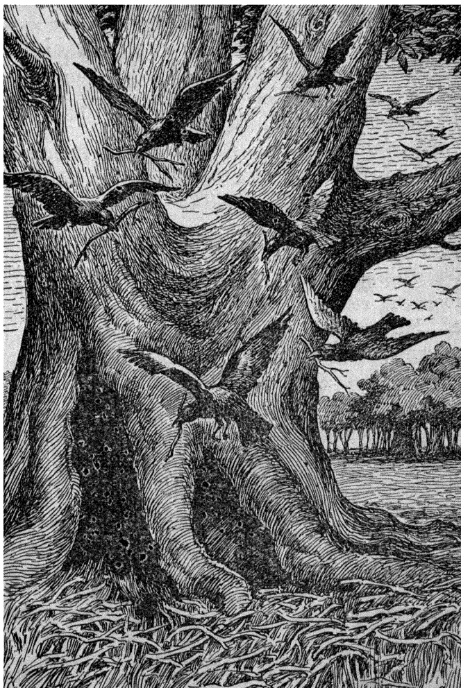
THE CROWS DROPPED THEIR WOOD IN THE DRY GRASS