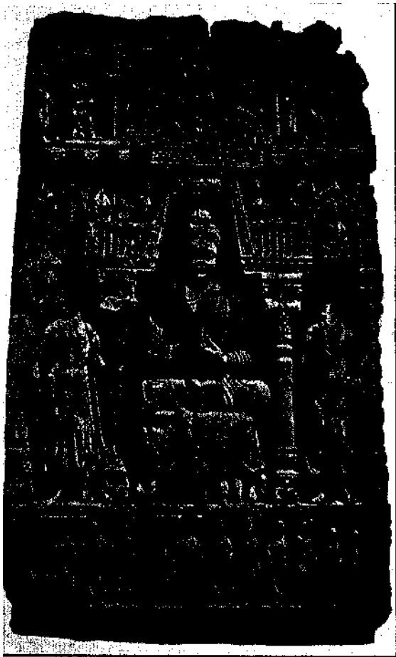
RELIEF FROM MUHAMMAD NARI, IN YUSUFZAI