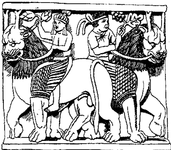
COMPARTMENT FROM THE THIRD ARCHWAY OF THE EAST GATEWAY AT SANCHI