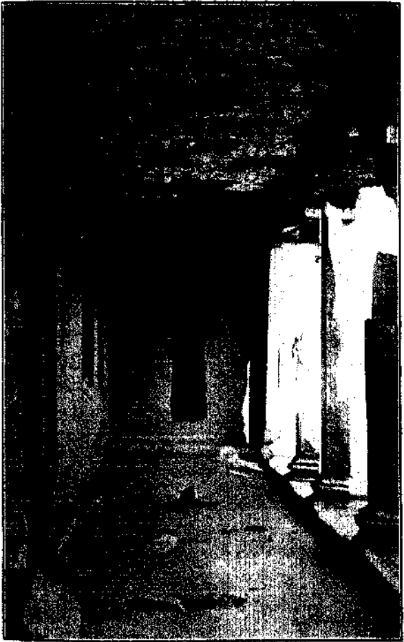
VERANDA, CAVE NUMBER SEVENTEEN, AJANTA