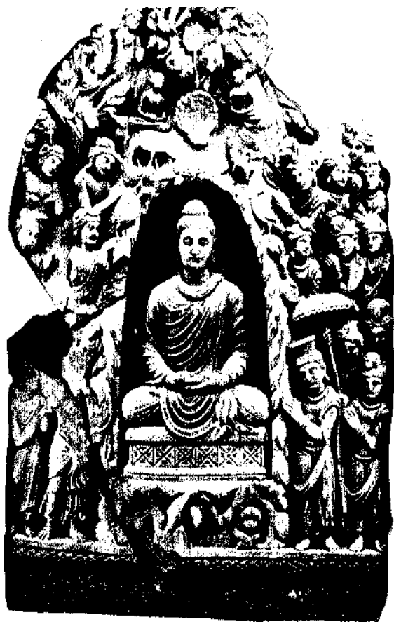
BUDDHA VISITED BY SAKRA AT THE INDRASAILA

A sculpture from LORIYAN TANGAI in the Calcutta Museum