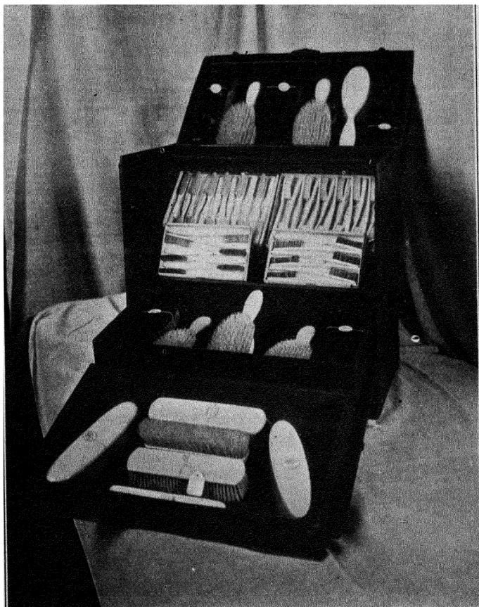
A SALESMAN'S SAMPLE CASE, SHOULD BE NEAT AND ORDERLY IN ARRANGEMENT.

than to have that feeling. If he refused, he might not carry resentment toward the salesman and a disposition to refuse another order as he will if he accepts goods that are not entirely satisfactory.