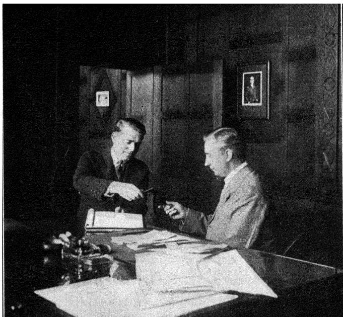
THE CLOSE OF THE SALE — "SIGN HERE, PLEASE."

The Psychological Moment for Closing. It is probable that in every sale there is some point at which it would be best to make the close. It is not always possible for the salesman to know just when he has