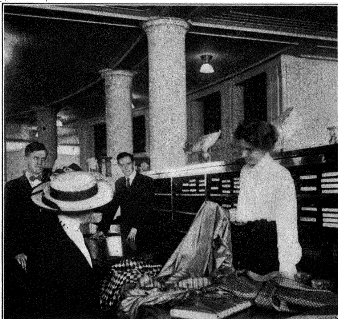
A SALESWOMAN SHOWING DRESS GOODS TO A PROSPECTIVE CUSTOMER. Floorman to the left in the background.

and unfair. There is no wonderful secret in salesmanship. It is the application of honesty, of good sense, and of a desire to serve, guided by the rules of psychology, and it is nothing more.