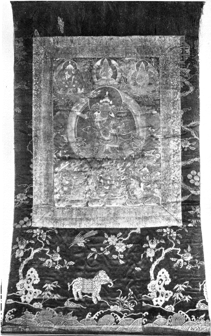
One of a collection of TIBETAN BANNERS recently acquired size of the one herewith 39 ins by 24 ins Price £12 10s