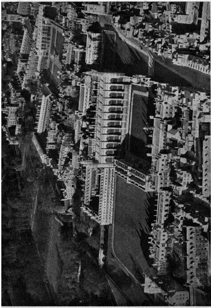
CAMBRIDGE FROM THE AIR SHOWING THE WHOLE OR PART OF THE FOLLOWING COLLEGES: QUEENS', ST. CATHARINE'S, CORPUS CHRISTI, KING'S, CLARE, CAIUS, TRINITY AND ST. JOHN'S, AND TRINITY HALL