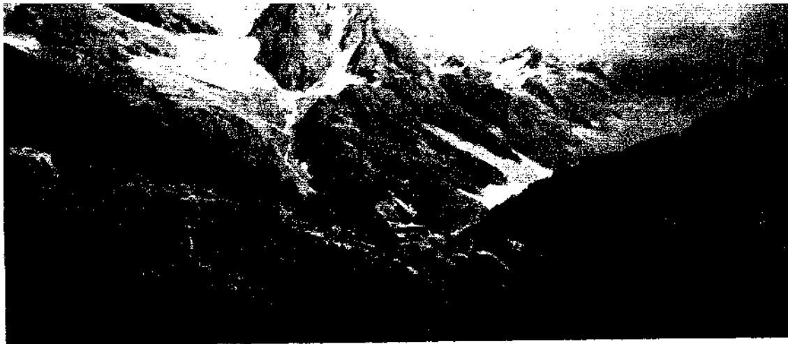
THE GLACIER OF MOUNT KOLAHOI FROM THE LIDAR VALLEY (page 53 and 77)..