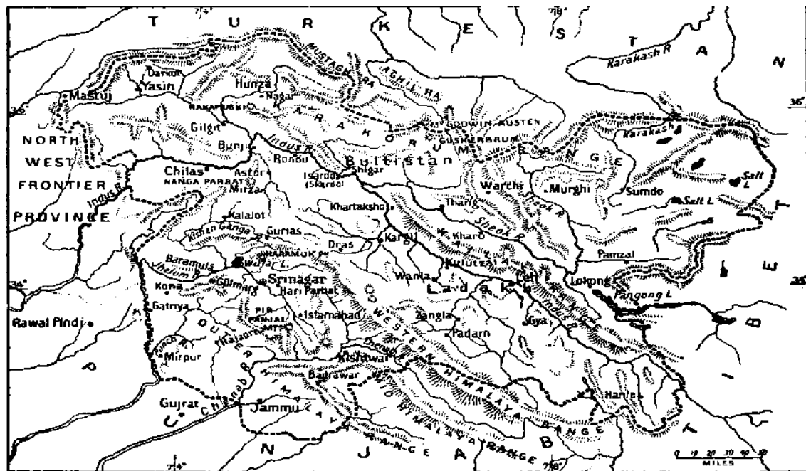
SKETCH MAP OF KASHMIR