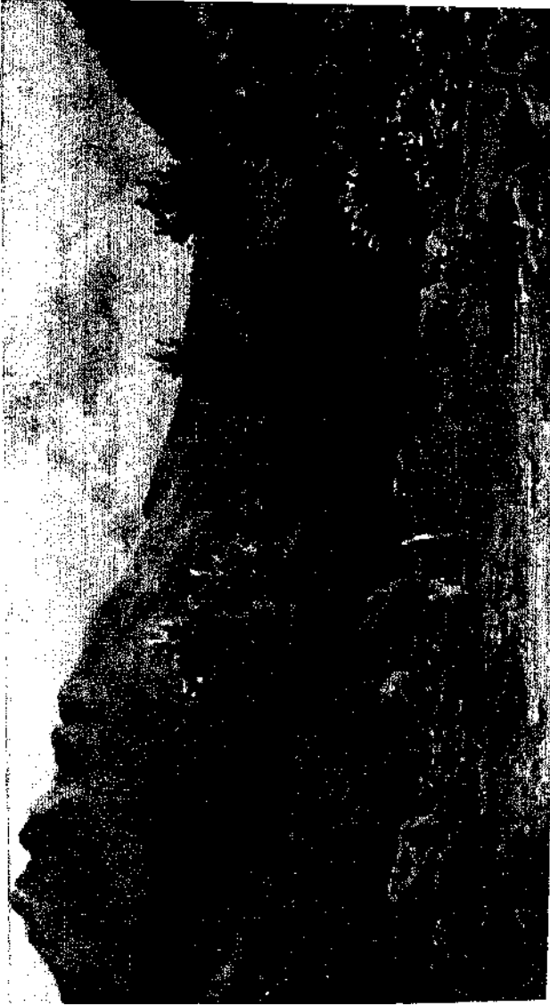
A TYPICAL VILLAGE OF THE LIDAR VALLEY (page 77).