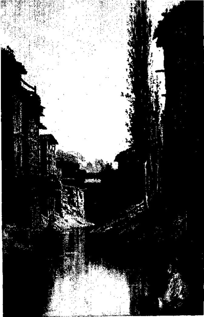
PICTURESQUE HOUSES ON THE MAR CANAL AT SRINAGAR (page