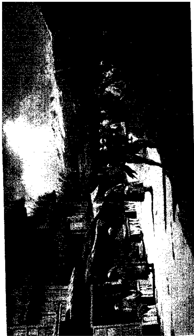
A BAZAAR AT SRINAGAR. SNOW MOUNTAINS IN THE DISTANCE (Pages 12 and 41).