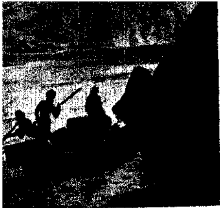
A WEDDING PARTY IX THE UPPER INDUS VALLEY.