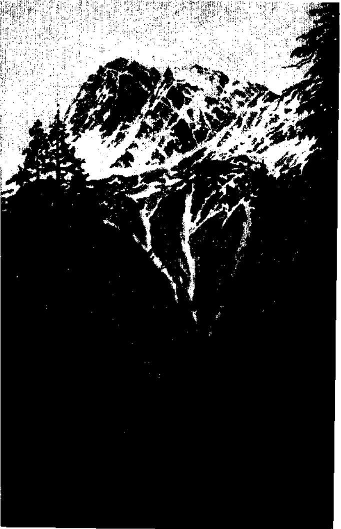
THE SNOW-CLAD SUMMIT OF KOTWAL FROM ABOVE KANGAN IN THE SIND VALLEY (page 76).