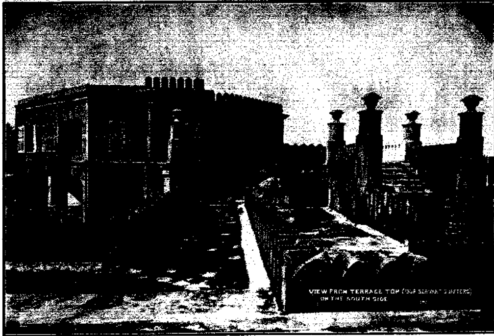
Hasht-banpda (Marine-Villa) on the site of the present University Buildings. View from Terrace top on the South side.