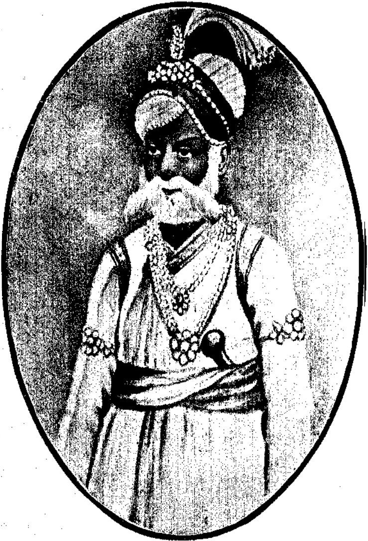
Ghulam Husayn 'Umdatul-Umara Bahadur Nawwab Walajah II (1795-1801 A.D.)