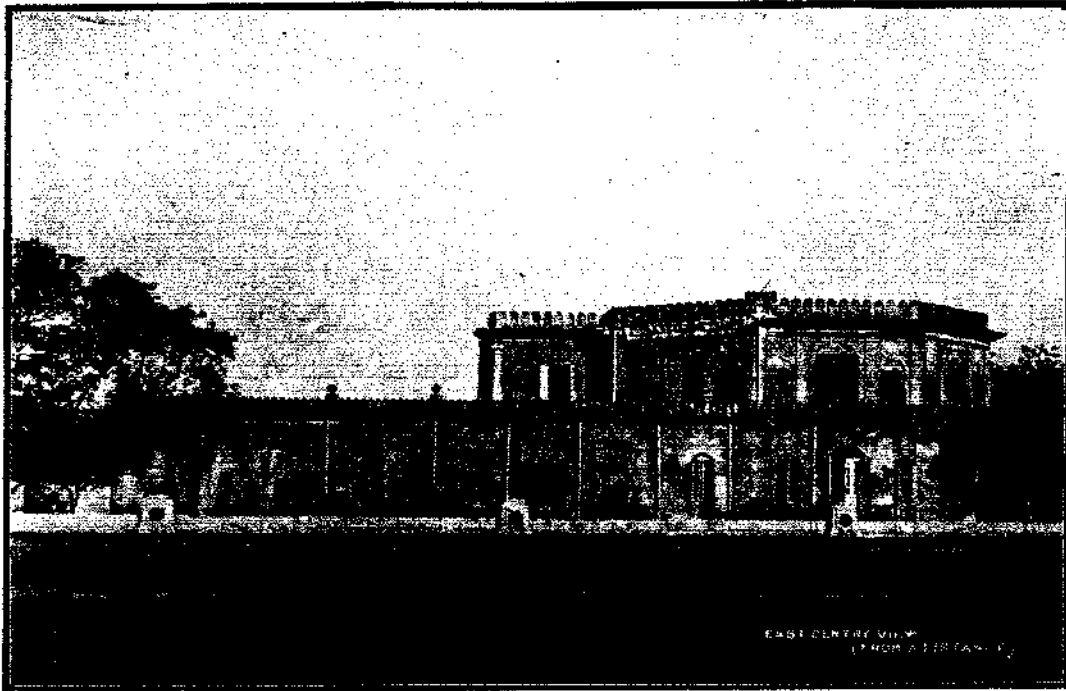
Hash-t-bangla (Marine-Villa) on the site of the present University Buildings. East Centre view (from a distance).