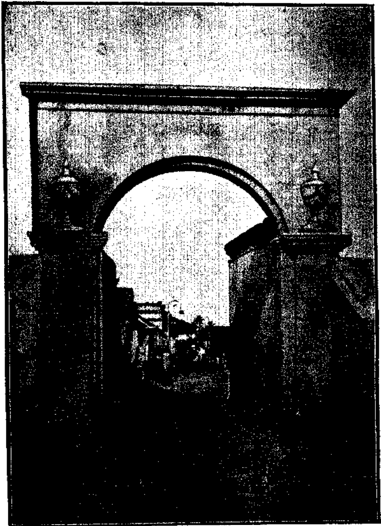
Kaman Darwaza on the Triplicane High Road.